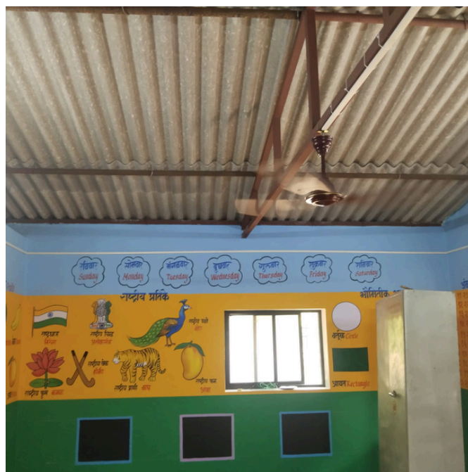
Solar panels were set up along with the lights and fan at Telangwadi AWC