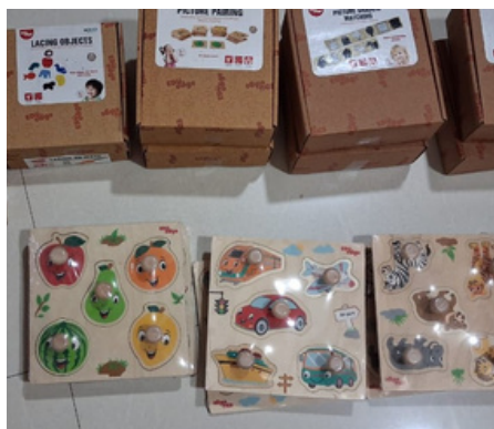
Teaching Learning Materials